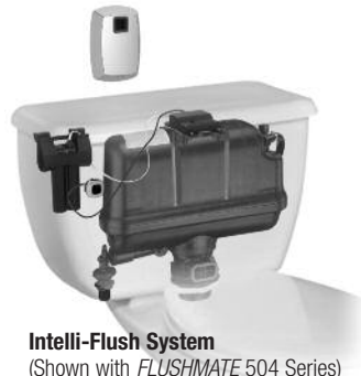
Intelli-Flush System (Shown with FLUSHMATE 504 Series)