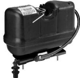
Model M-102540-F3 _ (for one piece toilet)